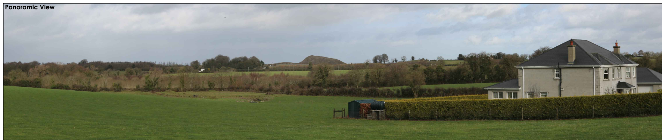
Viewpoint 7 North from L80142. View South from minor road L80142 approx 1km from the subject site. From this section of road the existing temporary overburden is clearly visible, however areas of proposed extraction would not be visible due to a combination of intervening vegetation and topography.